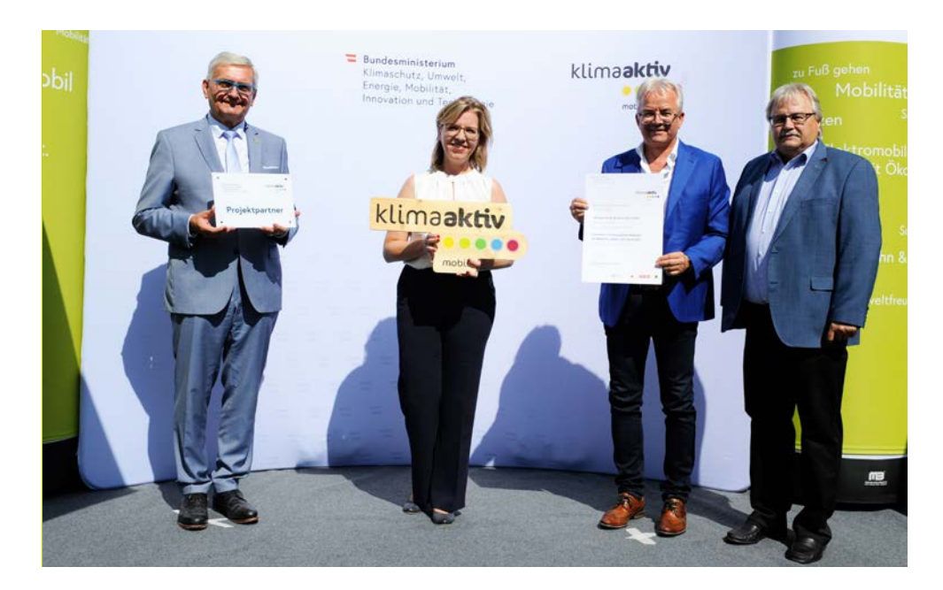
Figure 11: The city of Bruck an der Leitha is honoured for building cycling paths. In the picture: Mayor Gerhard Weil and Felix Böhm with Federal Minister for Climate Action Leonore Gewessler and President of the Austrian Association of Municipalities Alfred Riedl.