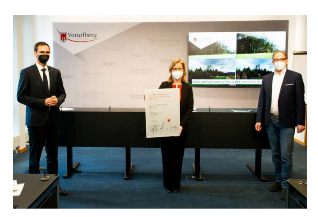
Figure 2: Federal Minister for Climate Action Leonore Gewessler, Vorarlberg's State Governor Markus Wallner and Member of the State Parliament Johannes Rauch sign the klimaaktiv mobil partnership between the state of Vorarlberg and the federal government to expand the cycling infrastructure in Vorarlberg.

As one of the initiatives taken to tackle the Covid-19 crisis, the Municipal Investment Act of 2020 has enabled municipalities and cities to benefit from an additional federal grant of 50% for expanding walking and cycling and combine it with the funds provided by klima aktiv mobil.