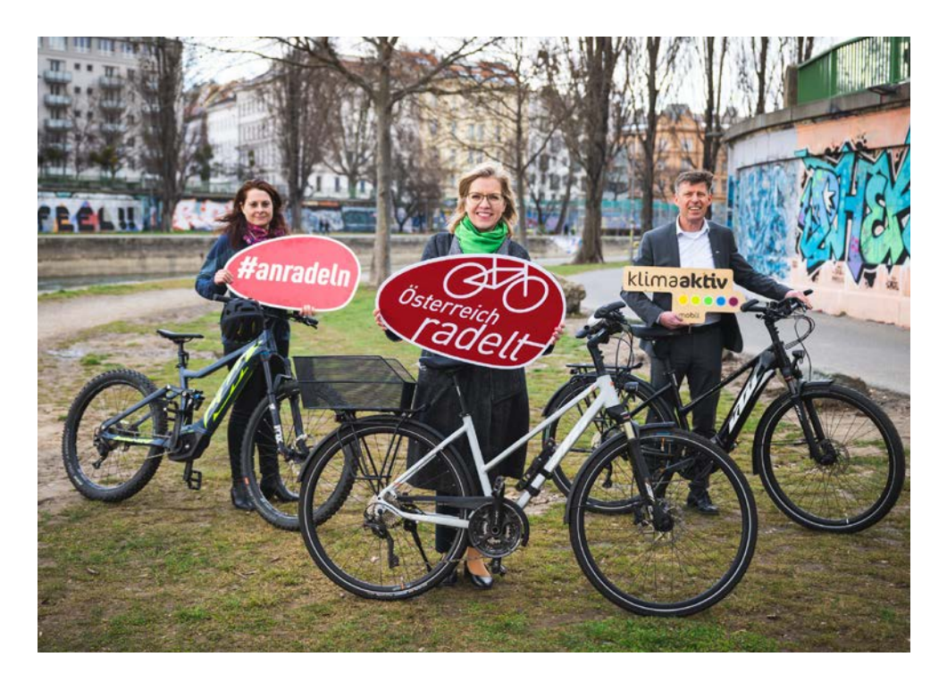
Figure 3: Federal Minister for Climate Action Leonore Gewessler gives the go-ahead to the large-scale nationwide cycling campaign "Österreich radelt".

In the field of mobility management, the klima aktiv mobil consulting programmes also focus on cycling and walking in Austria's businesses, cities and municipalities, tourism and educational institutions.