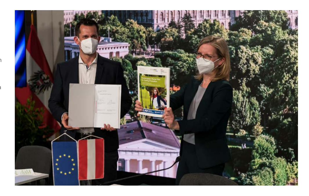
Figure 14: A historic moment for cycling in Europe under Austrian chairmanship: Federal Minister Leonore Gewessler and Federal Minister Wolfgang Mückstein present the first Pan-European Master Plan for Cycling Promotion adopted in Vienna under the leadership of Austria and France.

In a first implementation project – the EU project DanubeCyclePlans –, Austria and the countries in the Danube region have launched a cooperation to develop national cycling strategies. The EU project Transdanube.Travel.Stories (ETC-funded) is focused on fostering climate-friendly tourism mobility along the Danube – the Transdanube.Pearls. These activities will be expanded within the scope of the newly adopted THE PEP Partnership on Sustainable Tourism Mobility in the future.