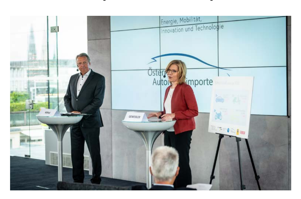
Figure 5: Minister for Climate Action Leonore Gewessler and Günther Kerle, Chairman of the Work Group of Automobile Importers in the Federation of Austrian Industries, present the new e-mobility funds 2020.

Established funding instruments of the BMK, i.e. the Climate and Energy Fund, the klima aktiv mobil programme and the national environmental support scheme, are used in the implementation of the support programmes. To facilitate the filing of funding applications, the funding process is managed in the form of a one-stop-shop by Kommunalkredit Public Consulting GmbH (KPC) (umweltfoerderung.at).